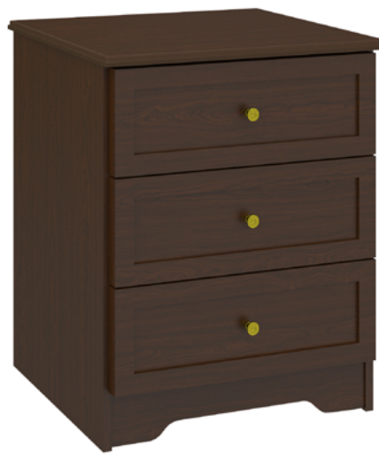
Model: MICH30 25W 19D 30H

Time-honored crafting and practical concerns blend to produce refined, functional furniture. OG edging and gently radiused corners add understated touches of distinction to these water- and scuff-resistant, fire-retardant products. Choose from dozens of hardware styles, including ADA-compliant. The product is required to be wall mounted for safety. Using the kit provided, please follow provided instructions exactly.